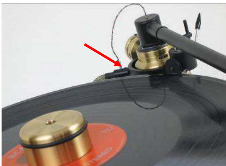
See cable fixing. Fig. 3.

If Stogi S is mounted on other turntables, move the tube by hand towards the spindle as if in an 'inner groove' position and ensure there is enough clearance for the rod and counterweights. If not, consult your dealer.