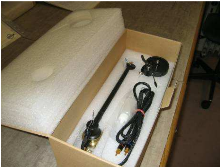
Stogi S packaging : armtube with cable, bearing base. Fig. 1

Armbase for other turntables with accessories ( 3x hex screw and nuts, Allen key 1.5, 3mm), mounting protractor, fingerlift for headshell.